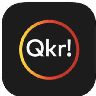
Apple Device App

Permission notes are to be signed electronically through the QKR app. If you require assistance, please see the ladies in the front office. A 'how to' guide can be found on the school website.