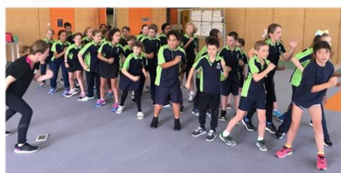
Year 5s at iDance

Please remember the Year 5s are selling icy poles for $1 at recess for funds toward their camp in 2019.