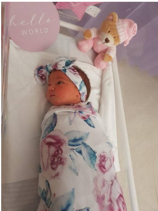
Here is Mrs B's baby girl Mia.

I will send the community assembly link tomorrow via Connect. Thank you for understanding and respecting our need to comply with the current COVID restrictions. If our state moves to Phase 5 next month we will return to our community assemblies in the covered assembly area.